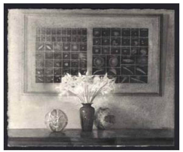
Artist Charles Ritchie

Check out our recent exhibits at http://aok.lib.umbc.edu/gallery/#anchor41025