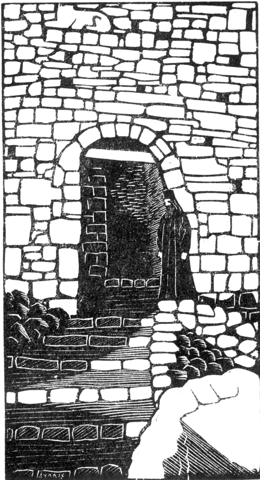
Woodcut illustration by Phyllis Gardner, pp. 35 from text: Casson, Stanley, and Phyllis Gardner. Rupert Brooke and Skyros . London: E. Mathews, 1921.