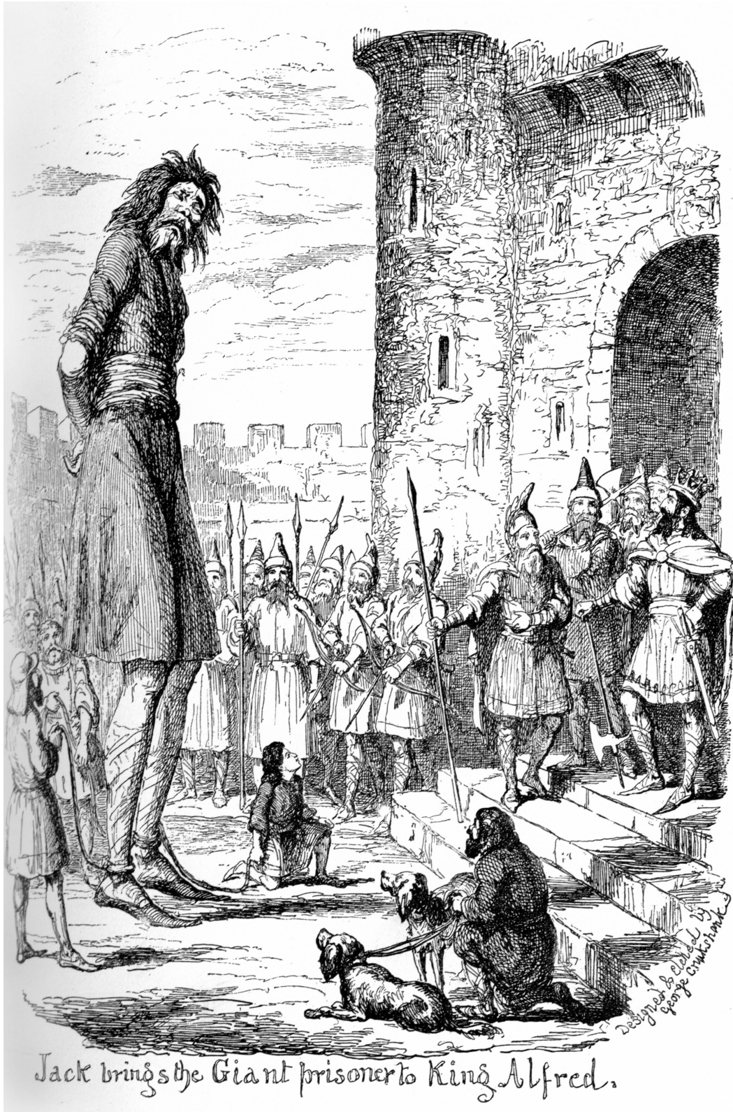
Jack brings the Giant Prisoner to King Alfred by Gerorge Cruikshank, pp. 99 from text: Cruikshank, George. The Cruikshank Fairy-book: Four Famous Stories . New York & London: G.P. Putnam's Sons, 1897.