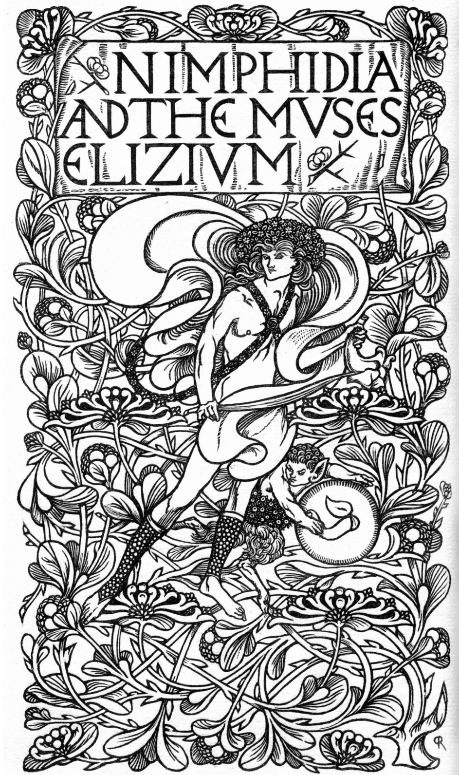
Woodcut frontispiece by Charles Ricketts from the text: Drayton, Michael, and John Gray. Nimphidia, and The Mvses Elizivm . London: Hacon & Ricketts, 1896.