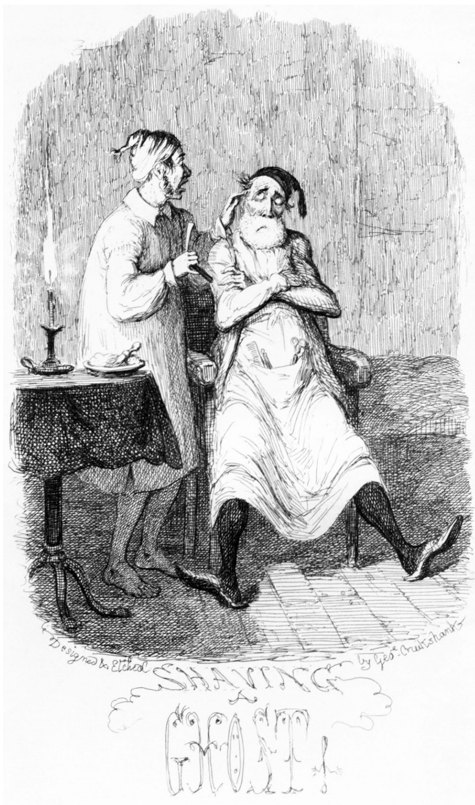
Shaving Ghost by George Cruikshank, frontispiece from text: Costello, Dudley, and Wellcome Historical Medical Library. Holidays with Hobgoblins: And Talk of Strange Things. London: John Camden Hotten, 1861.